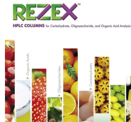
Products used in this application: