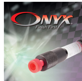
Products used in this application: