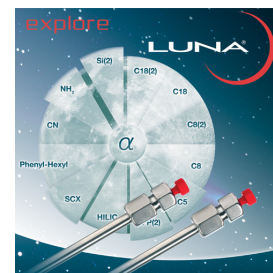
Products used in this application: