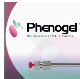
Products used in this application:

Detection: Differential refractometer @ nm (ambient) 8330